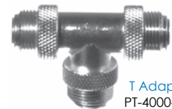
T Adapter PT-4000-027