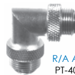
R/A Adapter PT-4000-026