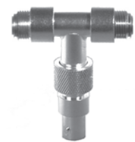
Without end connectors RFA-4059-A1

How to Use: Insert between antenna or dummy load