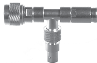
With N male (PT-4000-003) and N female (PT-4000-009) connectors (equiv. Motorola S8B80313B37) RFA-4059-A