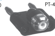
Banana Plug PT-4010-021