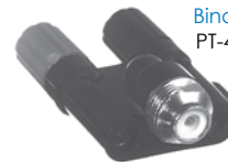
Binding Post PT-4010-020