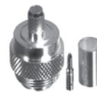
Male crimp PT-4010-030

PT-4010-062 — Mounting bulkhead connectors allows you to create or modify existing test fixtures ready for Unidapt™ use