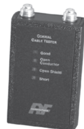
Unidapt™ Cable Tester