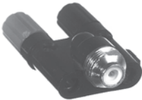
BINDING POST PT-4010-020