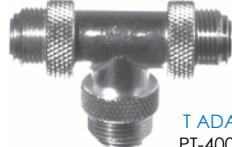
T ADAPTER PT-4000-027