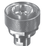
7/16 DIN MALE PT-4000-119