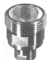
7/16 DIN FEMALE PT-4000-120