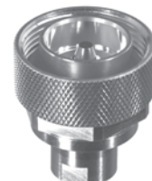
7/16 DIN MALE PT-4000-119