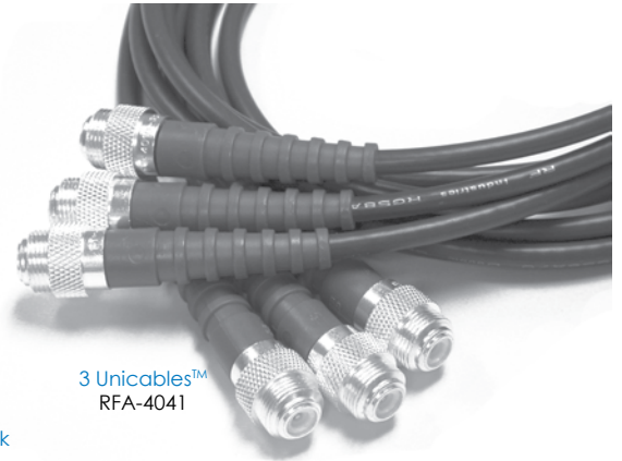
3 Unicable™ RFA-4041