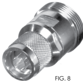
FIG. 8 RFD-1672-2