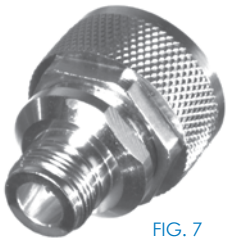
FIG. 7 RFD-1671-2