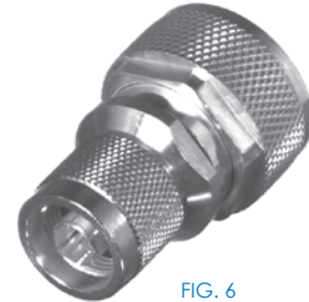
FIG. 6 RFD-1670-2