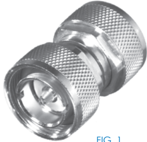
FIG. 1 RFD-1650-2

BODY: S - SILVER PIN/CONTACT: S - SILVER DIELECTRIC: T - TEFLON INTERFACE IMPEDANCE: 50 Ω FREQUENCY RANGE: 0 TO 7.5 GHZ PIM: ≥ -.150 DBC