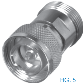
FIG. 5 RFD-1660-2