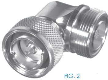
FIG. 2 RFD-1652-2