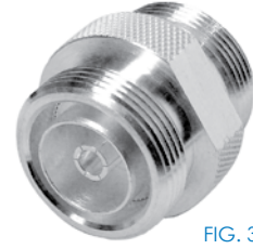
FIG. 3 RFD-1653-2