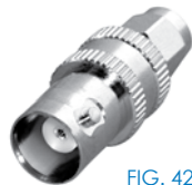
FIG. 42 RSA-3458