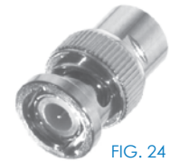
FIG. 24 RFE-6102