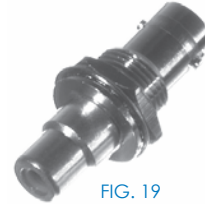
FIG. 19 RFB-1151