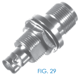
FIG. 29 RFN-1023-5