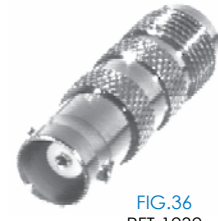
FIG. 36 RFT-1232