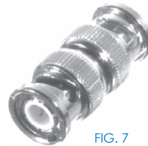
FIG. 7 RFB-1133