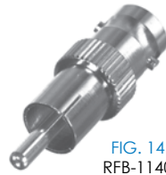
FIG. 14 RFB-1140