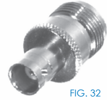
FIG. 32 RFN-1039-1