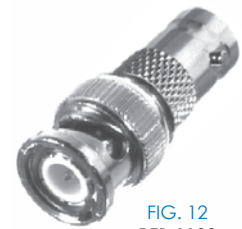
FIG. 12 RFB-1138

PHOTOS FOR REFERENCE ONLY, SHOWN AT 100% ACTUAL SIZE.