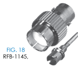
FIG. 18 RFB-1145,