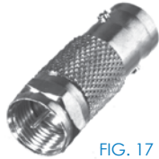
FIG. 17 RFB-1144