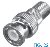
FIG. 22 RFB-1155