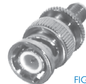
FIG. 44 RSA-3476, -1

PHOTOS FOR REFERENCE ONLY, SHOWN AT 100% ACTUAL SIZE.