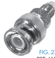
FIG. 27 RFE-6151