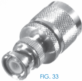
FIG. 33 RFN-1040-1