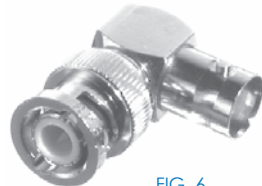
FIG. 6 RFB-1132