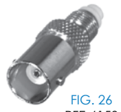
FIG. 26 RFE-6150