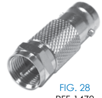
FIG. 28 RFF-1479

PHOTOS FOR REFERENCE ONLY, SHOWN AT 100% ACTUAL SIZE.