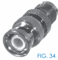
FIG. 34 RFT-1230