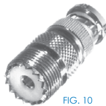
FIG. 10 RFB-1136