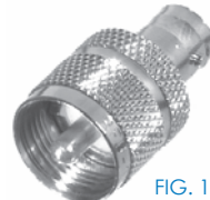
FIG. 11 RFB-1137