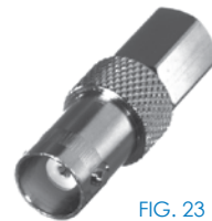
FIG. 23 RFE-6101