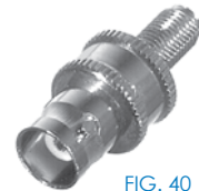
FIG. 40 RSA-3413