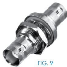
FIG. 9 RFB-1135, -I, -T