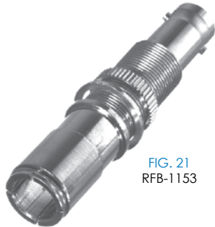
FIG. 21 RFB-1153