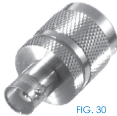
FIG. 30 RFN-1037-1