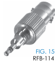
FIG. 15 RFB-1141