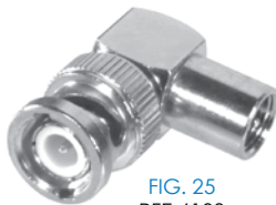
FIG. 25 RFE-6103