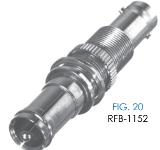
FIG. 20 RFB-1152