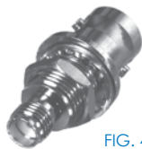
FIG. 41 RSA-3413-3