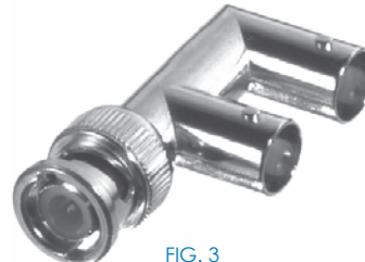
FIG. 3 RFB-1130-3