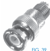
FIG. 39 RFU-627