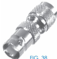
FIG. 38 RFU-622