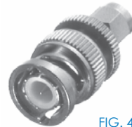
FIG. 43 RSA-3459