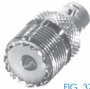
FIG. 37 RFU-545