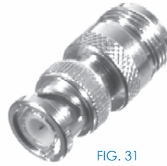
FIG. 31 RFN-1038-1