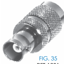
FIG. 35 RFT-1231