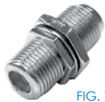
FIG. 7 RFF-1477