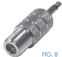
FIG. 8 RFF-1478