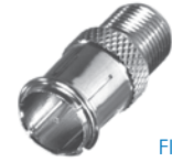
FIG. 3 RFF-1445-5, -5-1