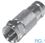
FIG. 9 RFF-1479