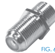
FIG. 6 RFF-1476, -1