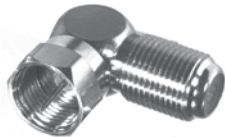
FIG. 4 RFF-1446-10