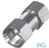
FIG. 5 RFF-1448