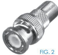
FIG. 2 RFB-1155