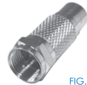
FIG. 10 RFF-1484

PHOTOS FOR REFERENCE ONLY, SHOWN AT 100% ACTUAL SIZE.