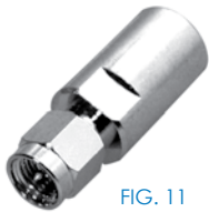
FIG. 11 RFE-6111