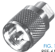
FIG. 12 RFE-6112