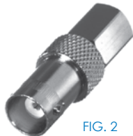
FIG. 2 RFE-6101