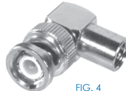
FIG. 4 RFE-6103