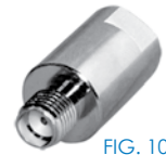
FIG. 10 RFE-6110