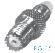
FIG. 15 RFE-6152