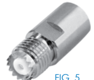
FIG. 5 RFE-6104