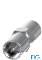
FIG. 1 RFE-6100

BODY: C - BLACK CHROME N - NICKEL PIN/CONTACT: G - GOLD DIELECTRIC: D - DELRIN T - TEFLON