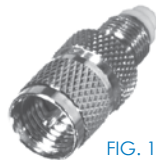
FIG. 16 RFE-6153