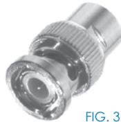
FIG. 3 RFE-6102