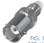
FIG. 13 RFE-6150