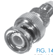
FIG. 14 RFE-6151