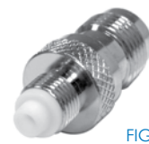
FIG. 18 RFT-1240