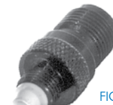
FIG. 19 RFT-1240-1

PHOTOS FOR REFERENCE ONLY, SHOWN AT 100% ACTUAL SIZE.