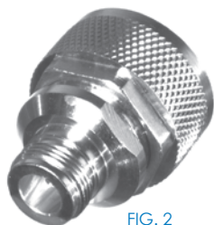
FIG. 2 RFD-1671-2 (shown at 75% size)