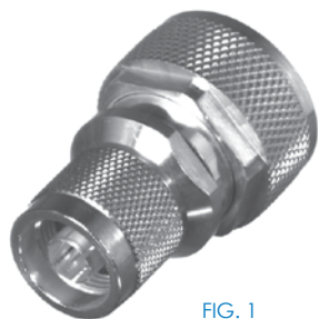
FIG. 1 RFD-1670-2 (shown at 75% size)

BODY: N - NICKEL S - SILVER SS - STAINLESS STEEL PIN/CONTACT: G - GOLD S - SILVER DIELECTRIC: T - TEFLON