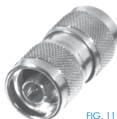
FIG. 11 RFN-1014-1