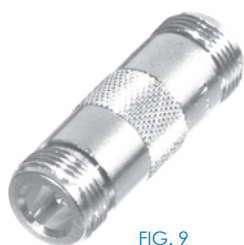
FIG. 9 RFN-1013-1