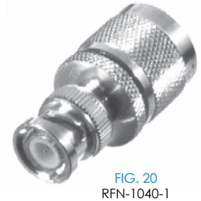
FIG. 20 RFN-1040-1