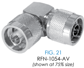
FIG. 21 RFN-1054-AV (shown at 75% size)