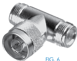
FIG. 6 RFN-1010-1 (shown at 75% size)