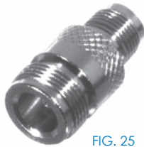
FIG. 25 RFT-1239