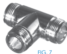
FIG. 7 RFN-1011-1 (shown at 75% size)