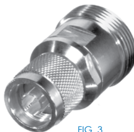
FIG. 3 RFD-1672-2 (shown at 75% size)