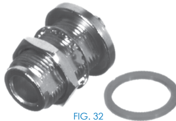
FIG. 32 RSA-3477-03