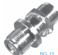
FIG. 12 RFN-1023

PHOTOS FOR REFERENCE ONLY, SHOWN AT 100% ACTUAL SIZE UNLESS OTHERWISE INDICATED.