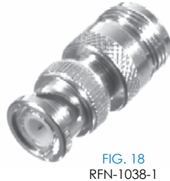
FIG. 18 RFN-1038-1