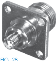
FIG. 28 RSA-3290, -10