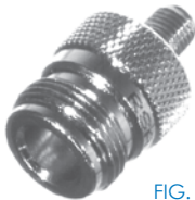
FIG. 31 RSA-3477, -2