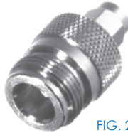
FIG. 29 RSA-3452