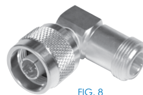
FIG. 8 RFN-1012-1 (shown at 75% size)