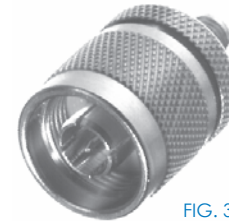
FIG. 33 RSA-3478

PHOTOS FOR REFERENCE ONLY, SHOWN AT 100% ACTUAL SIZE UNLESS OTHERWISE INDICATED.