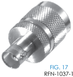
FIG. 17 RFN-1037-1