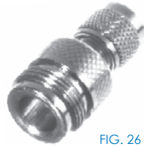
FIG. 26 RFU-620