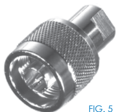
FIG. 5 RFE-6107