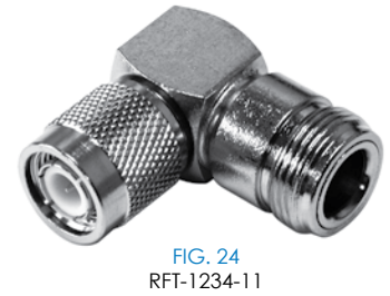
FIG. 24 RFT-1234-11

PHOTOS FOR REFERENCE ONLY, SHOWN AT 100% ACTUAL SIZE UNLESS OTHERWISE INDICATED.