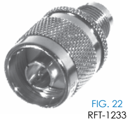
FIG. 22 RFT-1233