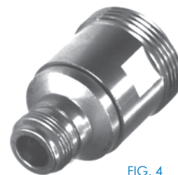
FIG. 4 RFD-1673-2 (shown at 75% size)