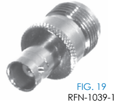
FIG. 19 RFN-1039-1