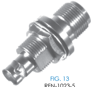
FIG. 13 RFN-1023-5