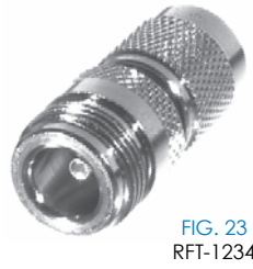
FIG. 23 RFT-1234