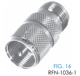
FIG. 16 RFN-1036-1