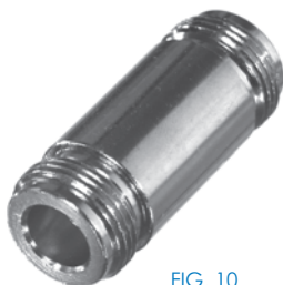
FIG. 10 RFN-1013-1-03