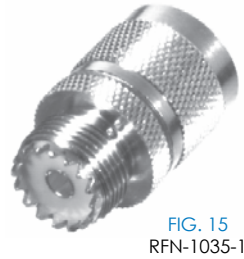
FIG. 15 RFN-1035-1