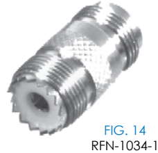
FIG. 14 RFN-1034-1