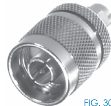
FIG. 30 RSA-3453