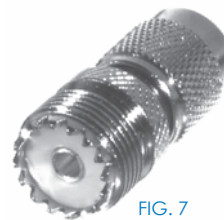
FIG. 7 RFT-1235