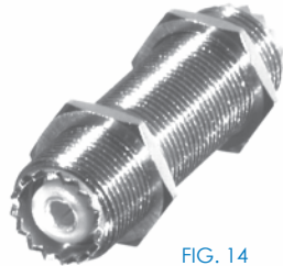
FIG. 14 RFU-537, -SO