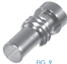
FIG. 9 RFU-530, -S, -531, -1, -S