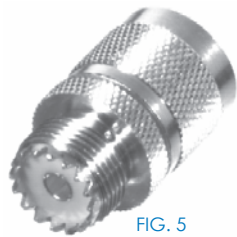
FIG. 5 RFN-1035-1