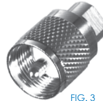
FIG. 3 RFE-6112