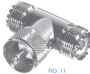
FIG. 11 RFU-533