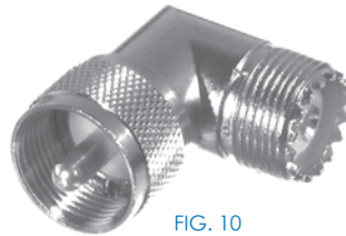
FIG. 10 RFU-532