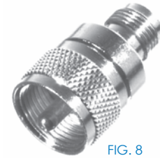
FIG. 8 RFT-1236