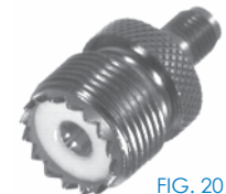
FIG. 20 RSA-3475

PHOTOS FOR REFERENCE ONLY, SHOWN AT 100% ACTUAL SIZE.