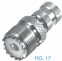
FIG. 17 RFU-621