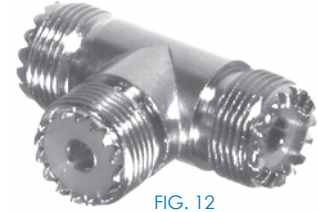
FIG. 12 RFU-534

PHOTOS FOR REFERENCE ONLY, SHOWN AT 100% ACTUAL SIZE.