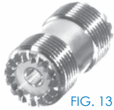
FIG. 13 RFU-536