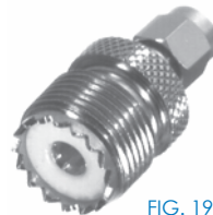
FIG. 19 RSA-3457