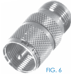
FIG. 6 RFN-1036-1