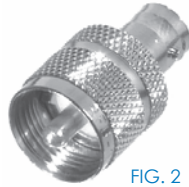
FIG. 2 RFB-1137