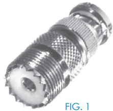
FIG. 1 RFB-1136

BODY: N - NICKEL S - SILVER PIN/CONTACT: G - GOLD S - SILVER DIELECTRIC: D - DELRIN DAP - DIALLYLPHTHALATE T - TEFLON