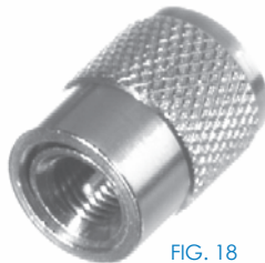
FIG. 18 RFU-645