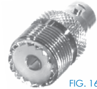
FIG. 16 RFU-545