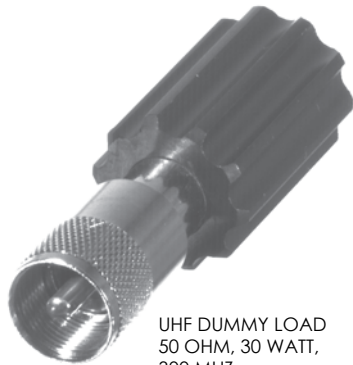
UHF DUMMY LOAD 50 OHM, 30 WATT, 300 MHZ RFU-551

Each RFA-4057-A kit includes 3, 6, 10, and 20 dB, 50 ohm, 1W BNC attenuators. Also included is a 50 ohm, 2W, BNC Shunt and a 50 ohm, 30W, 300 MHz dummy load. All connectors are nickel plated with silver contacts. This kit is conveniently packaged in a clear plastic case.