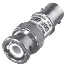
BNC ATTENUATOR 50 OHM, 1 WATT RFA-4050 (3 DB) RFA-4051 (6 DB) RFA-4052 (10 DB) RFA-4053 (20 DB)