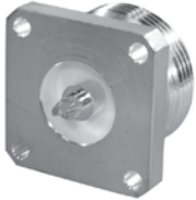
FIG. 8 RFD-1640-2