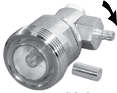
FIG. 5 RFD-1630-2-C, -2-C1