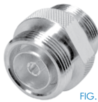
FIG. 13 RFD-1653-2