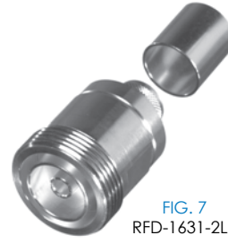
FIG. 7 RFD-1631-2L2