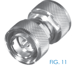
FIG. 11 RFD-1650-2