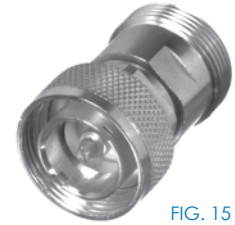
FIG. 15 RFD-1660-2

PHOTOS FOR REFERENCE ONLY, SHOWN AT 60% ACTUAL SIZE