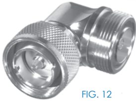
FIG. 12 RFD-1652-2