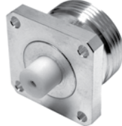
FIG. 9 RFD-1643-HS