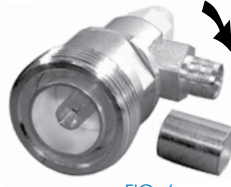
FIG. 6 RFD-1630-2-E