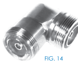
FIG. 14 RFD-1658-2