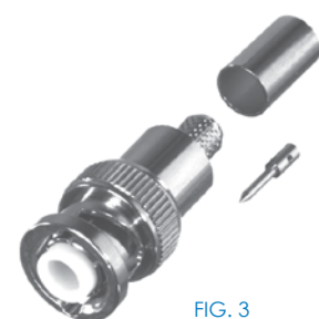
FIG. 3 RHV-106-D