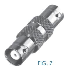
FIG. 7 RHV-134

PHOTOS FOR REFERENCE ONLY, SHOWN AT 100% ACTUAL SIZE.