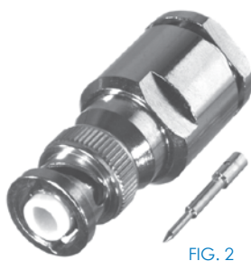
FIG. 2 RHV-100-E, -X