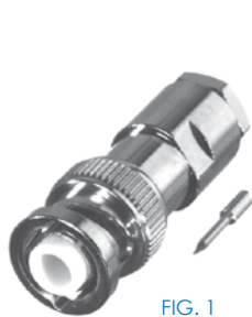
FIG. 1 RHV-100-D