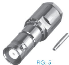
FIG. 5 RHV-124-D