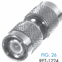
FIG. 26 RFT-1224