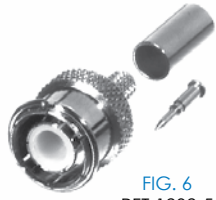
FIG. 6 RFT-1202-5