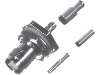
FIG. 21 RFT-1212-B, -B1

PHOTOS FOR REFERENCE ONLY, SHOWN AT 100% ACTUAL SIZE.