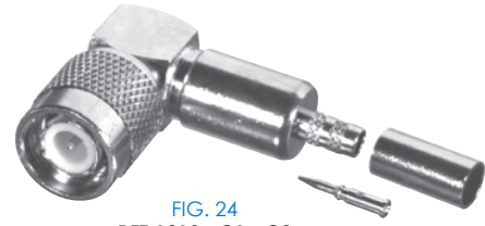
FIG. 24 RFT-1218, -C1, -C2