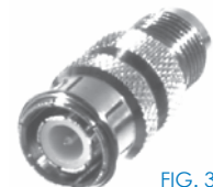
FIG. 32 RFT-1242

PHOTOS FOR REFERENCE ONLY, SHOWN AT 100% ACTUAL SIZE.