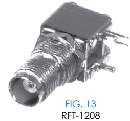
FIG. 13 RFT-1208

PHOTOS FOR REFERENCE ONLY, SHOWN AT 100% ACTUAL SIZE.