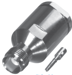
FIG. 22 RFT-1214-I