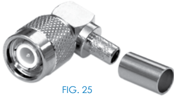
FIG. 25 RFT-1218-X