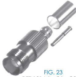
FIG. 23 RFT-1216-1, -C1, -C2, -I, RFT-1217-P, -X