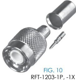
FIG. 10 RFT-1203-1P, -1X