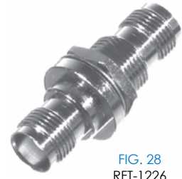
FIG. 28 RFT-1226