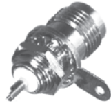
FIG. 19 RFT-1211-1, -1-03