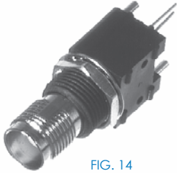
FIG. 14 RFT-1209-1B