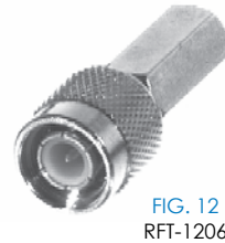
FIG. 12 RFT-1206