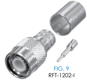
FIG. 9 RFT-1202-I