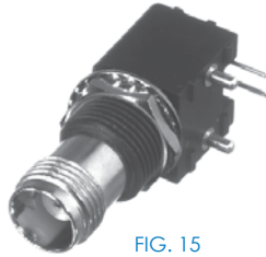
FIG. 15 RFT-1209-B