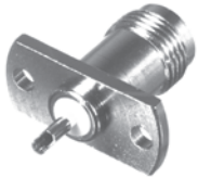
FIG. 18 RFT-1210-03