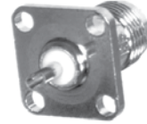
FIG. 17 RFT-1210, -15