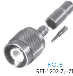
FIG. 8 RFT-1202-7, -7T