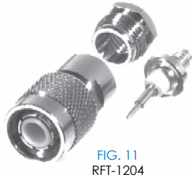
FIG. 11 RFT-1204