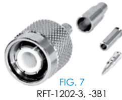
FIG. 7 RFT-1202-3, -3B1