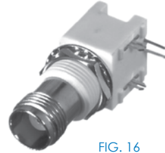
FIG. 16 RFT-1209-W, W-05