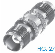
FIG. 27 RFT-1225