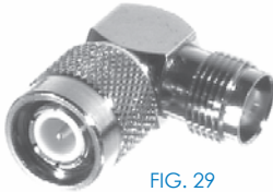
FIG. 29 RFT-1227