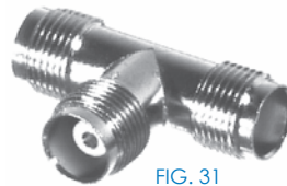
FIG. 31 RFT-1229