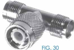
FIG. 30 RFT-1228