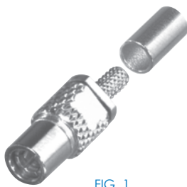
FIG. 1 RSB-700-179-1