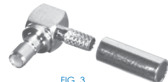
FIG. 3 RSB-750-1B, -1B1

PHOTOS FOR REFERENCE ONLY, SHOWN AT 150% ACTUAL SIZE.