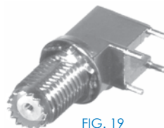
FIG. 19 RFU-606-5