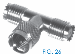
FIG. 26 RFU-631