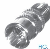
FIG. 28 RFU-643

PHOTOS FOR REFERENCE ONLY, SHOWN AT 100% ACTUAL SIZE.