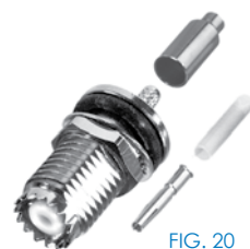
FIG. 20 RFU-617-B, -B1