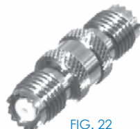
FIG. 22 RFU-629