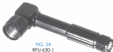
FIG. 24 RFU-630-1