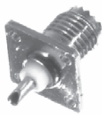
FIG. 17 RFU-603, -1