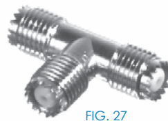
FIG. 27 RFU-632